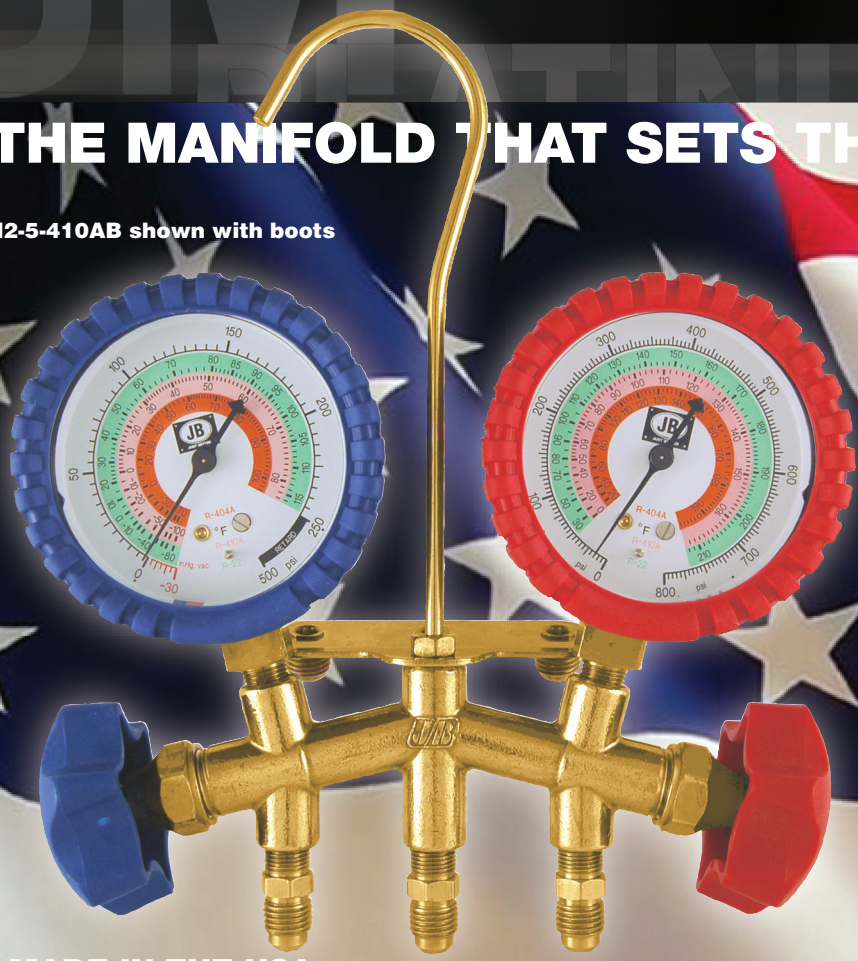
M2-5-410AB shown with boots

Zero leakage high pressure raised seat for positive seating