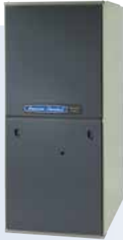
Platinum 95 95 Comfort-R™ Variable-Speed, Modulating, Communicating

Our most efficient and powerful gas furnace just might be our most comfortable too. With AccuLink™ communicating capability, continuous Comfort-R™ mode and an array of other innovative features, the Platinum Series gives your home maximum efficiency with controlled comfort.