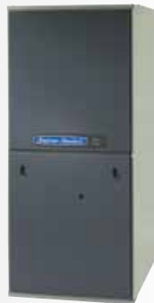
Silver 95 95 Single-Stage