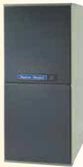
Gold 95 95 High Efficiency Two-Stage