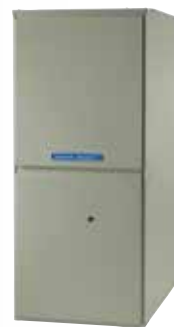
American Standard 92 90 Single-Stage