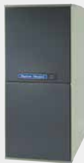
Silver 95h 95 High Efficiency Single-Stage

Designed with value in mind, the Silver Series provides you with the comfort you want, the efficiency and durability you need and, of course, the American Standard commitment to quality you expect.