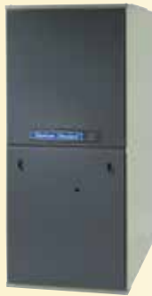
Gold 95v 95 Comfort-R™ Variable-Speed

High quality and high efficiency mean a high standard of comfort for your home. The Gold Series offers just that. Whether you choose variable-speed technology, or a two-stage offering with the power to increase your overall system efficiency, you can be sure that each one contains American Standard's quality craftsmanship.