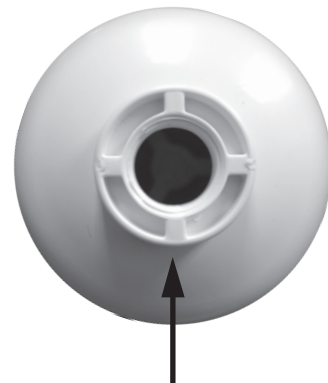
3/8" FPT Connections

Introducing a new in-line treatment product specific for the treatment of the condensate water produced by today's high efficiency furnaces.