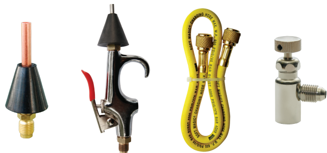
Flushing Tool R x 11-flush Gun R x 11-flush Hose Injection Valve

(Injection Valve Fits Pneu-flush®, Zerol®Ice, and A/C Re-New as well)